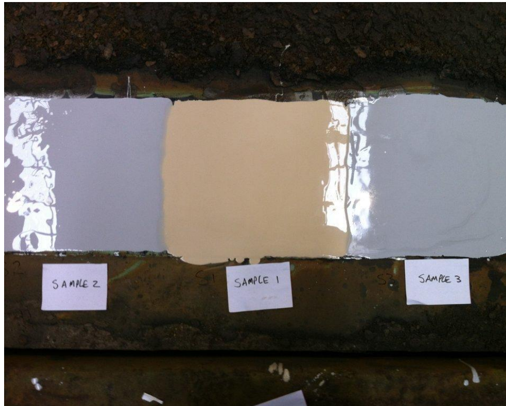
Photo showing 3 samples of different coatings

One of the technical advisors visited the site to gain a clearer understanding of the coating requirements. A 300 mm X 1000 mm area was prepared to trial three recommended coatings. All coatings made by Dynaciv.