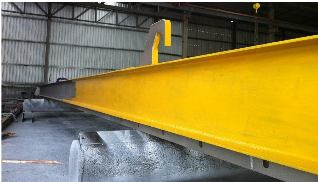
Photo of a beam being coated with Dynaciv protective epoxy coat

Recently Dynaciv were contacted by a large galvanising plant to provide a long-term solution to protect their carrier beams and oven doors. The beams as shown in the photo below are used to transport metal sections from the various acid baths to the oven and finally to the hot dip bath. These beams are exposed to strong acids, moist conditions and temperatures in the excess of 400°C (when over the bath).