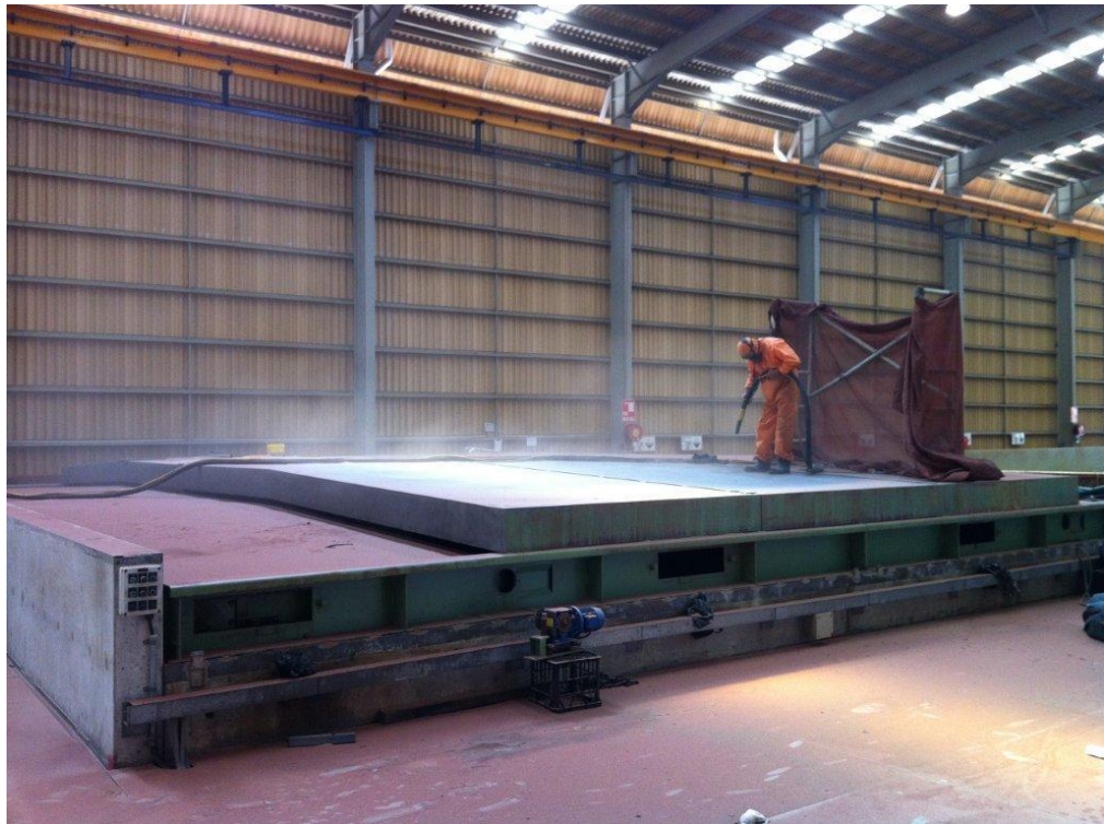
Photo showing abrasive blasting of the oven doors

To prepare the doors for the epoxy coating, we blasted the surface to a near white finish (AS.1627.4 Class 2½ ).