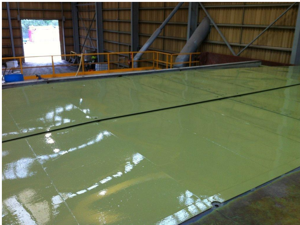
Photo showing half a door already coated

Soon after a large section was blasted, we applied the first coat of the formulated epoxy to avoid flash rust. The epoxy was applied by a standard epoxy safe roller.