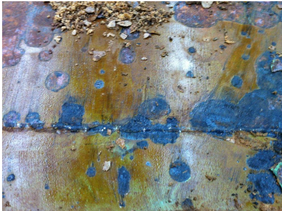
Photo showing corrosion damages to oven door